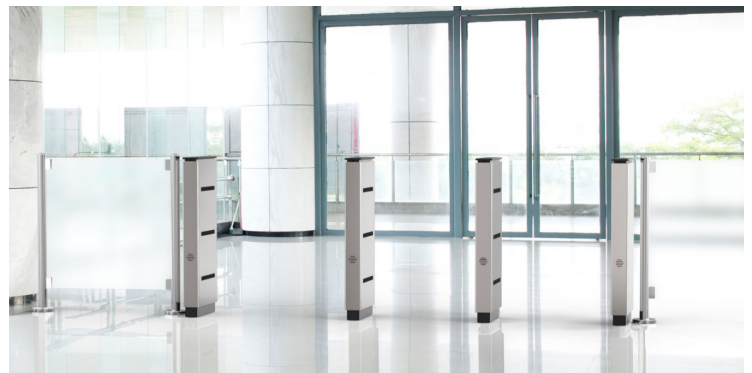
Modern design blends with any lobby (Cabinet Finish and Lid Color Options Available)

Step up your operations and monitoring with our optional LaneAdmin browser-based software. LaneAdmin integrates remotely with any networked CP3000, instantly providing a virtual desktop view so your attendants or security team can perform operational functions such as processing one-time passages and changing operational directions.