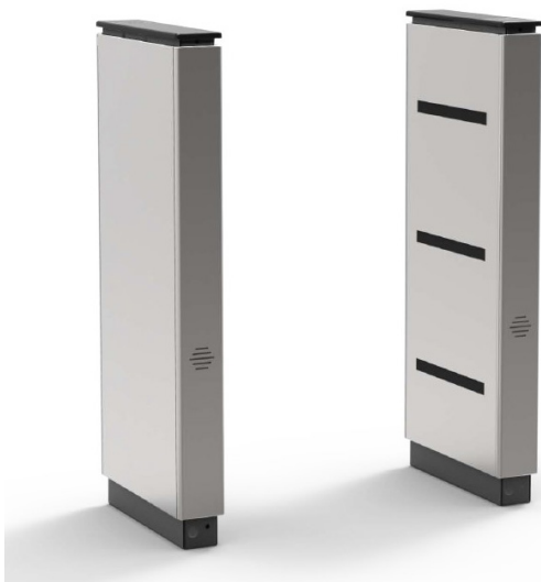
Narrow Profile Cabinets (Cabinets Just 4" Wide)

(28" Standard Opening with Optional 36" ADA Opening)